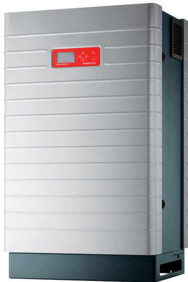
IP 42/ IP 54