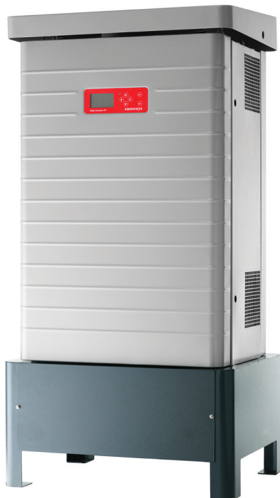
IP 55/ Outdoor